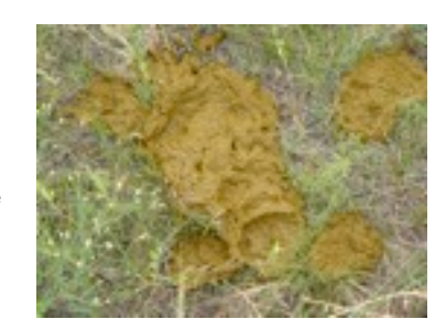
Loose stools like this one are indicative of a high protein diet.

I took 20 samples of plants that cattle were eating, collecting the parts of the plant that I observed they selected. I took them to Weld Laboratories in Greeley, Colorado and had them analyzed. The plants and their results are listed here in order of the preference the cattle displayed for them.