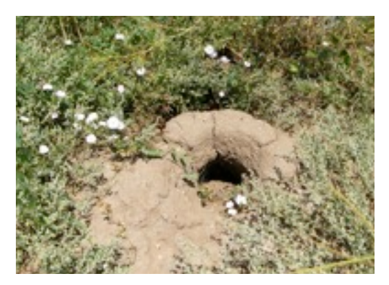
Almost no grass grew in the vacant prairie dog town, but the herd spent a great deal of time here because of the bindweed, prostrate pigweed, sunflowers, cutleaf nightshade and prickly lettuce that was found there.

Normally I'm not concerned about the impact of healthy forage and pastures on cattle's willingness to eat targeted weeds because the weeds themselves are usually at least as nutritious as everything else available to them. Unfortunately, that was not the case this year. As I found from this project, the target weeds were significantly lower in nutritional value than the other forages the animals chose in pasture.