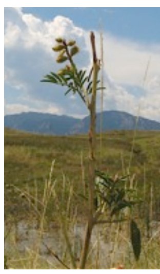
A well-grazed Wild Licorice plant.

This is important information for understanding how to manage cattle in pasture for weed control. In 2007 and 2008 trained cattle readily ate both late-season diffuse knapweed and dalmatian toadflax in pasture, probably because the drier climate in those years produced less vegetation. (July 2008 was the third driest and warmest month on record.) Available forage during those years was primarily grasses, the target weeds, horehound, wormwood sagewort, and Canada and musk thistle.