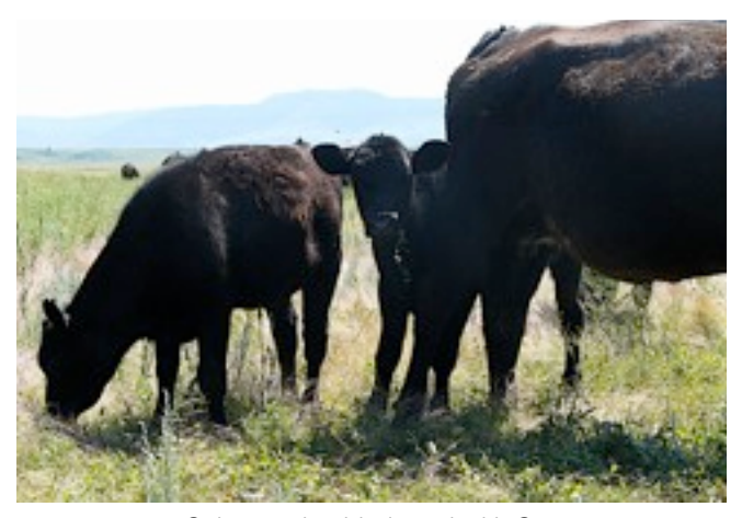
Calves eating bindweed with Cow

Studies indicate that when young animals learn to eat a low-quality forage early in life, or when they learn to eat it from their mothers, they will continue to eat it even when they have free-choice of high-quality foods (Provenza et al 2003). Based on this, it is possible that the offspring that learned to eat the target weeds as calves with mother in 2008 may have been eating more of the target weeds than the animals we were following in the Mayhoffer pasture. Unfortunately, the offspring were not part of this project. Following up on the foraging habits of trained cows' offspring will give us additional information for managing cattle as weed managers.