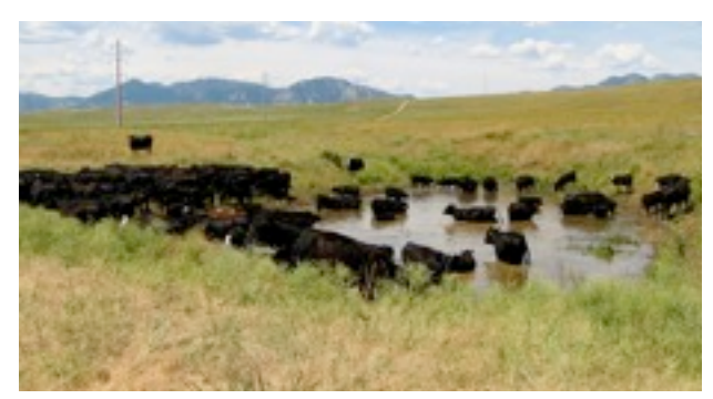
The two herds remained together for the rest of the project period, traveling together in the 500 acre pasture.

From July 12 through August 21 we observed the cattle in pasture which grew from 300 acres to 500 acres when the herd broke through an electric fence and accessed the southern part of the pasture that was normally inhabited by prairie dogs. To encourage them to spend more time in areas of our target weeds, we put salt blocks and a molasses-based supplement tub in a large patch of dalmatian toadflax. Progress on the two target weeds, dalmatian toadflax and diffuse knapweed was minimal. We found evidence that animals were grazing some of the weed, but were unable to observe if the new trainees were eating it. We found little evidence that diffuse knapweed was being grazed.