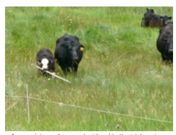
A rare picture of our project herd in the trial pasture.